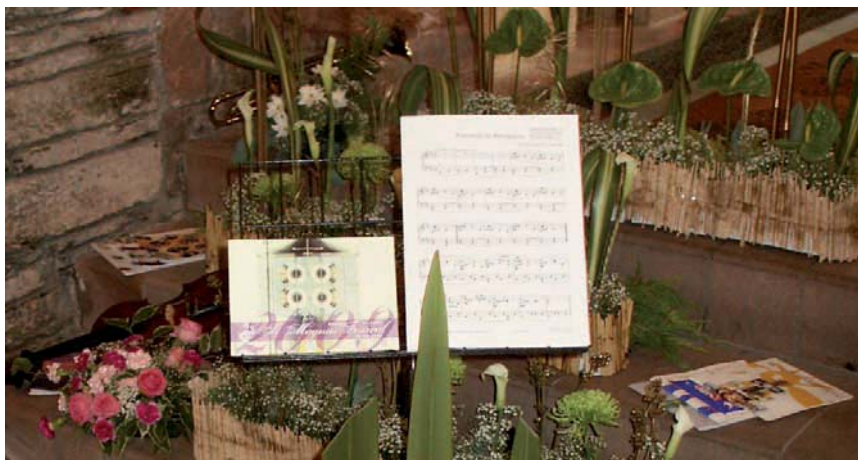
Flower arrangement from the 2009 Festival, representing the founding of the St Magnus Festival

KIRKWALL FLOWER ARRANGEMENT CLUB: will present our annual flower festival in St Magnus Cathedral from Wednesday 4th August to Sunday 8th August inclusive.